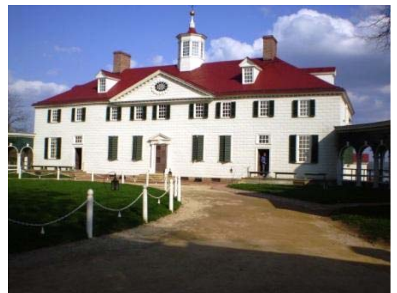
Figure 12 Mount Vernon

Antnee now settled back on his spot and it appeared as if he was nearing the end of his tale. He began: