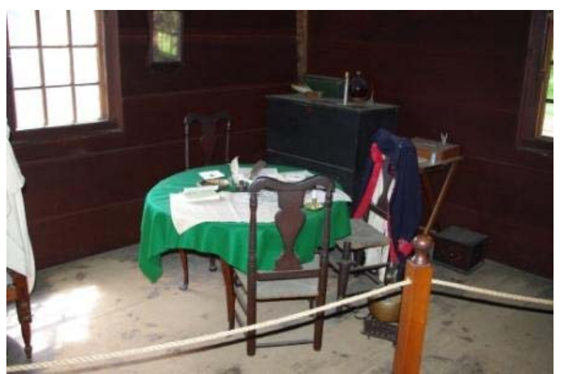
Figure 11 Lafayette's Table at Morristown

day. From then on there was peace until spring. But then things began to improve greatly, yes sir they improved greatly!"