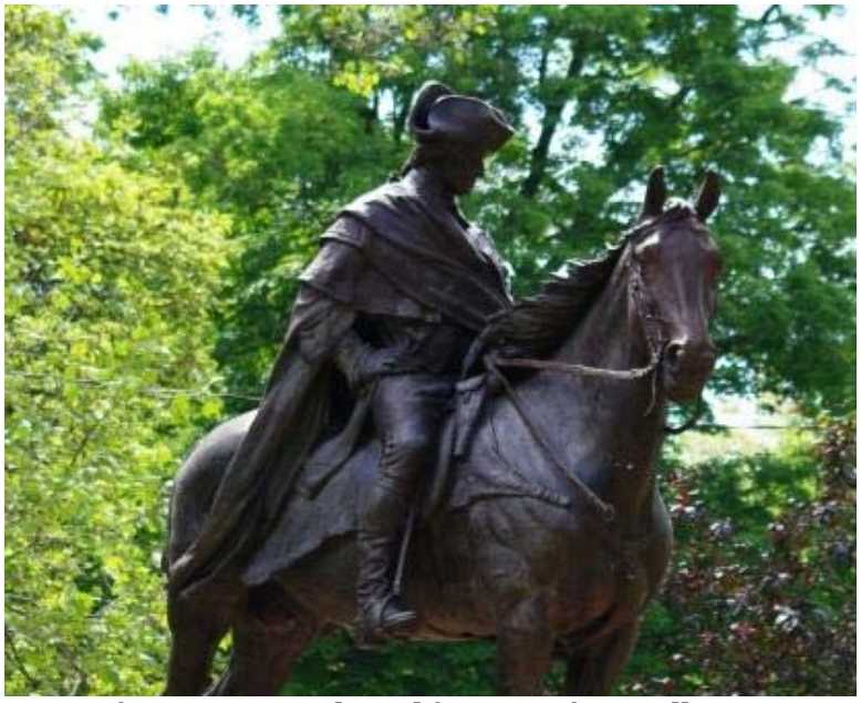
Figure 1 General Washington, His Excellency

had. I on the other hand now suspected that this was going to be not only a history lesson and another example of how squirrels save humanity but would be a morality tale, for Antnee was moving in that direction as he regaled me over the past few months!