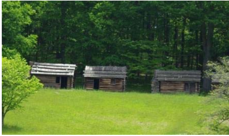
Figure 8 Jockey Hollow Huts

across, I mean gold Sir, truly an unruly group. Poor Washington had to write memos, reports, and all the while the men were starving and freezing."