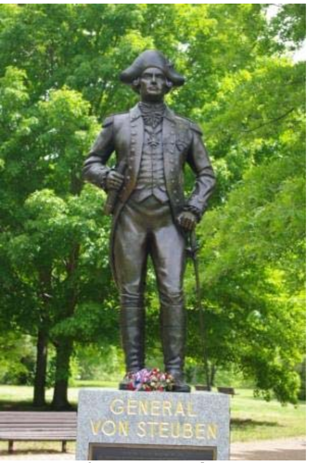
Figure 5 Von Steuben

Antnee took a rest. I thought for a moment that this may have been a bit of an exaggeration but as I later learned most of it is true.