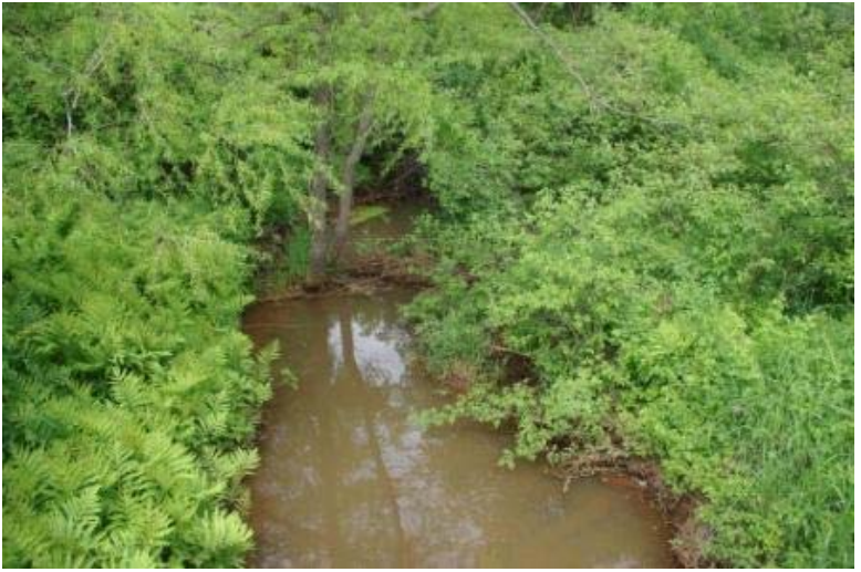
Figure 4 Spotswood South Brook Crossing

"Running from east to west were several tributaries of the Spotswood Brook, a north, middle and south branch of the Spotswood Brook Sir, small, muddy, with much vegetation, but truly little water. That would be a problem later in the day as the heat burned down on the men! The brooks provided some protection from advancement of the enemy but they also blocked any retreat or fast movement."