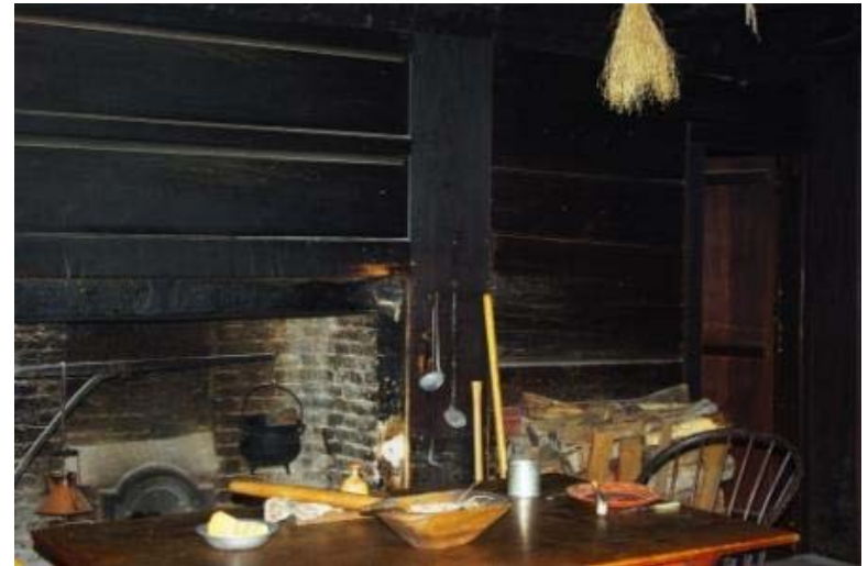
Figure 7 Kitchen at Morristown

"You see Sir the senior officers stayed at Ford's Mansion, the junior officers and men at Jockey Hollow. There were good kitchens at Fords, and none at Jockey Hollow."