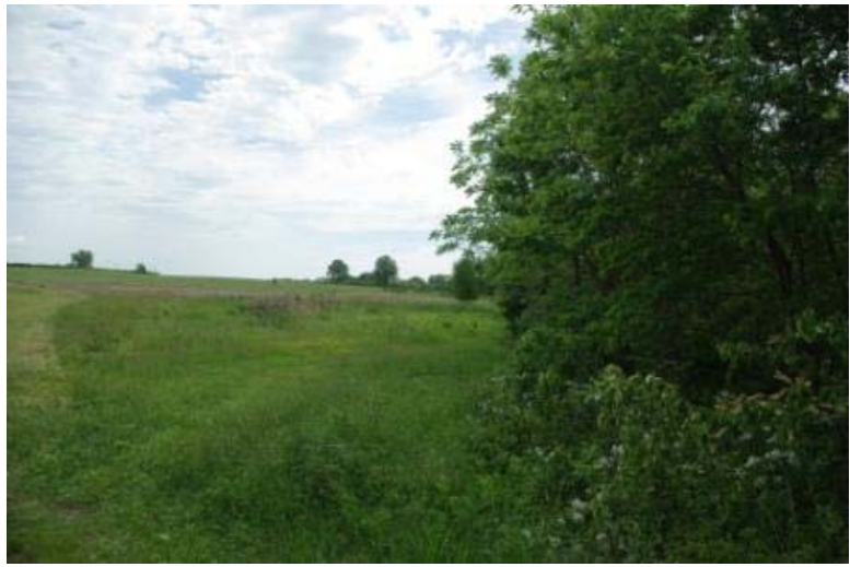
Figure 3 Forman's Hill at Monmouth

"Running from east to west were several tributaries of the Spotswood Brook, a north, middle and south branch of the Spotswood Brook Sir, small, muddy, with much vegetation, but truly little water. That would be a problem later in the day as the heat burned down on the men! The brooks provided some protection from advancement of the enemy but they also blocked any retreat or fast movement."