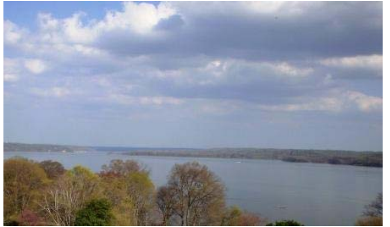
Figure 13 View of Potomac from Mount Vernon

"News had come to Morristown that his Excellency had been elected the first President of the new United States. He would be inaugurated on April 30th on the steps of the building on Wall Street in New York. Nathaniel was now quite old but he decided that he and his fellow squirrels from the War would all go to honor the new President. Thus, Nathaniel set out from Morristown; it would be a long trip, for he was quite aged. They went to Bottle Hill, then Chatham, over the pass of the Watchungs Short Hills, at