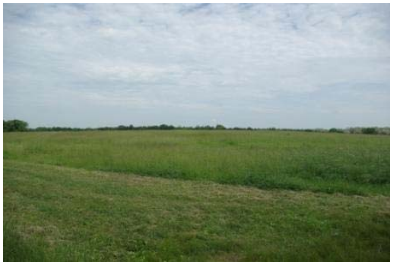
Figure 2 Field of Attack at Monmouth, Sutfin Farm

been planted a month prior and now the crops were all destroyed, thousands of men marching."